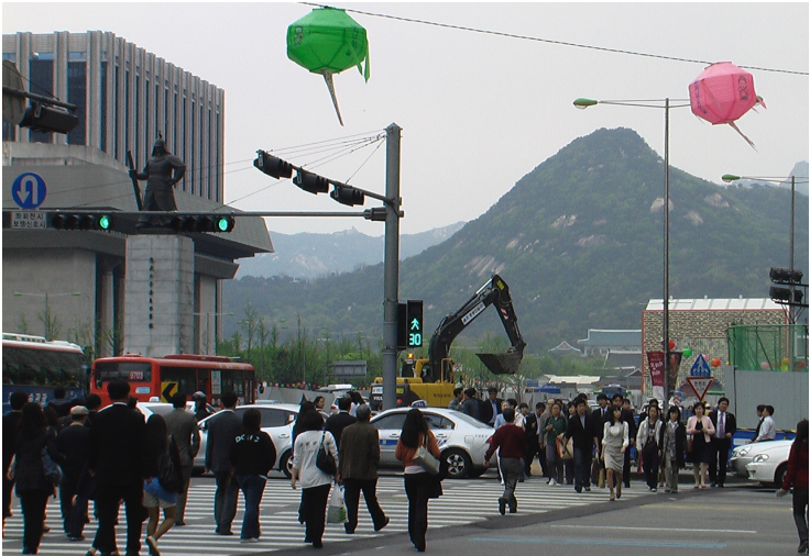
and mountains surrounding the city — Busan the second largest city in Korea, from a temple inside the town.

KOREA IS DIFFERENT — fitness Elderly Koreans are often really really fit. The country is covered in mountains. Retired people climb mountains day after day. Many literally keep a climbing practice, the way others do Buddhism. Once a day, twice a week etc. The Seoul subway is full of small groups in carefully chosen gear heading off for a day in the hills. And these hills are steep. Mountains inside the city — downtown Seoul on one of the main streets. Seoul continues on out beyond that small mountain, backdrop to the Blue House, Korea's equivalent of our White House.